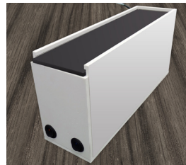
Black DuLite with White LED (not lit)