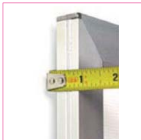
as thin as 0.85"~1.97" in thickness