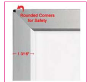
Round corners for safety